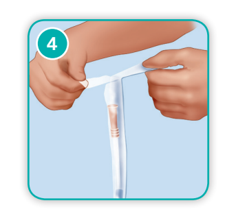
STEP 4: To activate the hydrophilic coating, make sure the catheter is soaked in water for at least 15 seconds. Open the package by peeling the tabs on the connector side.