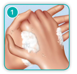
STEP 1: Wash hands thoroughly with soap and water.